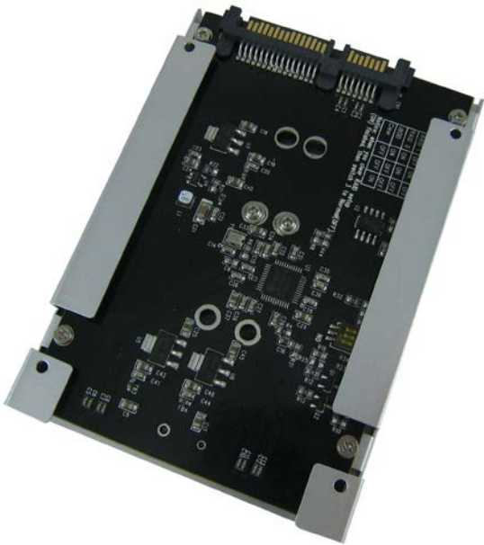
R2021D Raid Card