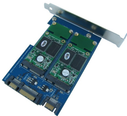
Mini PCI-e (mSATA) Custom Size