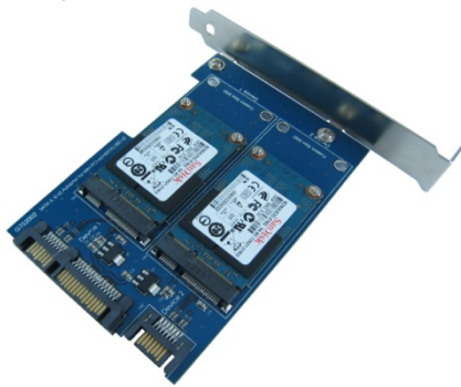
Mini PCI-e (mSATA) Custom Size