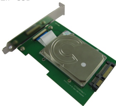
Assembly 1.8" ZIF HDD