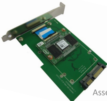
Assembly Intel ZIF SSD