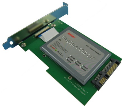
Assembly 1.8" ZIF SSD