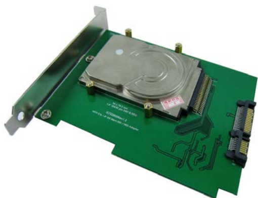
Assembly 1.8" IDE HDD (High:8.0mm)