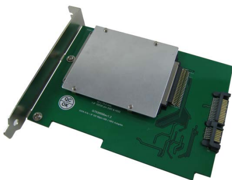
Assembly 1.8" IDE HDD (High:5.0mm)

Where the definition can be installed to comply with the PCI-e standard bracket the computer can install CB945MB adapter.