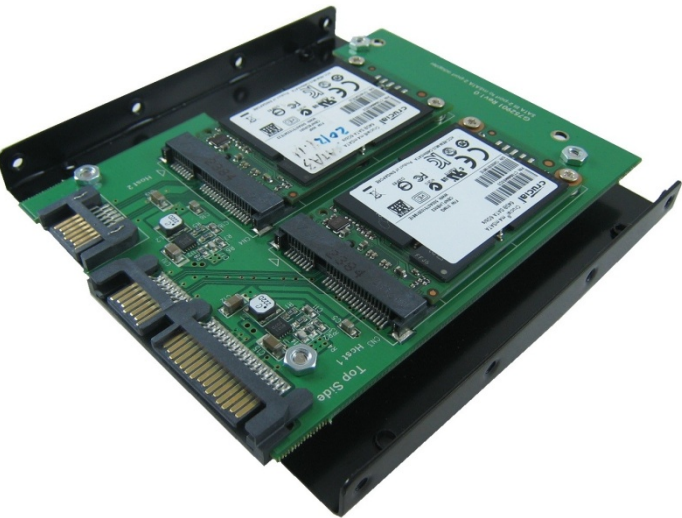
CB963DE9 Adapter with 3.5" Bracket