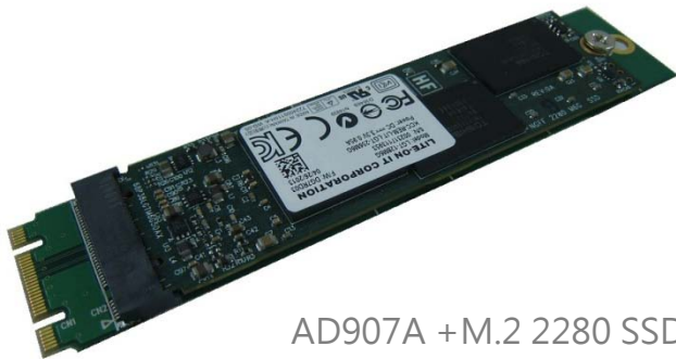
AD907A +M.2 2280 SSD