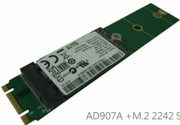
AD907A +M.2 2242 SSD

AD907A modules are M.2(NGFF) to M.2(NGFF) adapter. It provides M.2 B+M key dual notch golden finger, and one M.2 67pin B key connector. Use with AD904A adapter, can be used as the test carrier board for M.2 SSD. Due to the frequent mating test M.2 SSD, likely to cause M.2 connector failure on the host, resulting in a host maintenance difficulties. Through the use of AD907A carrier board, once a connector failure, the carrier board can be replaced immediately, without affecting the test work.