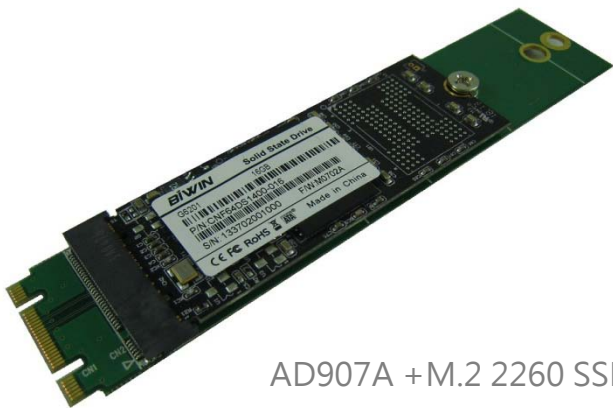
AD907A +M.2 2260 SSD