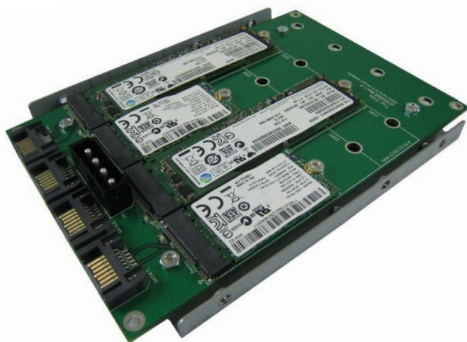
AD904E Adapter+ M.2 SSD