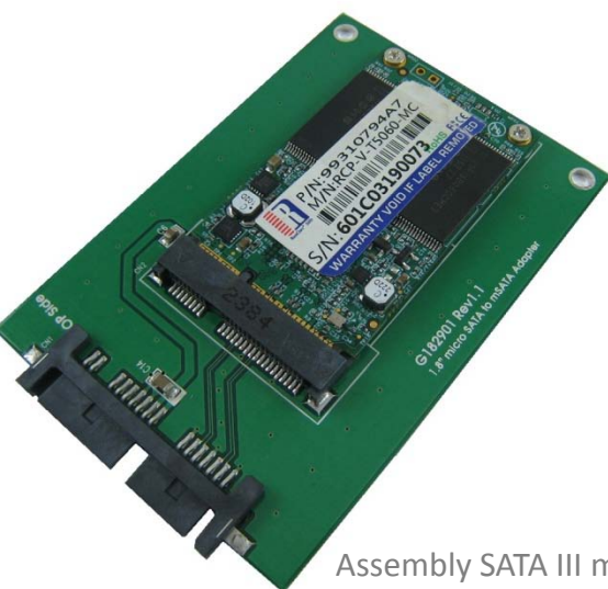
Assembly SATA III mSATA SSD

AD763FA9 is Micro SATA to mSATA adapter, providing one 7+9pin Micro SATA connector on the host connection and one Mini PCI-e 52-pin connector on the SSD storage devices connections. When assembled, it can operate in a variety of operating systems. Such as DOS, Windows 95, 98, XP, 2000, Vista, Win 7, Linux, Unix, and so on.