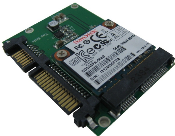
Assembly SATA III mSATA SSD

AD563FA9 is SATA to mSATA adapter, providing one 7+15pin SATA connector on the host connection and one Mini PCI-e 52-pin connector on the SSD storage devices connections. When assembled, it can operate in a variety of operating systems. Such as DOS, Windows 95, 98, XP, 2000, Vista, Win 7, Linux, Unix, and so on. AD563FA9 adapter allows the installation of mSATA SSD as system disk, boot the operating system directly, without having to install any drivers, but does not affect the execution speed of the mSATA SSD.