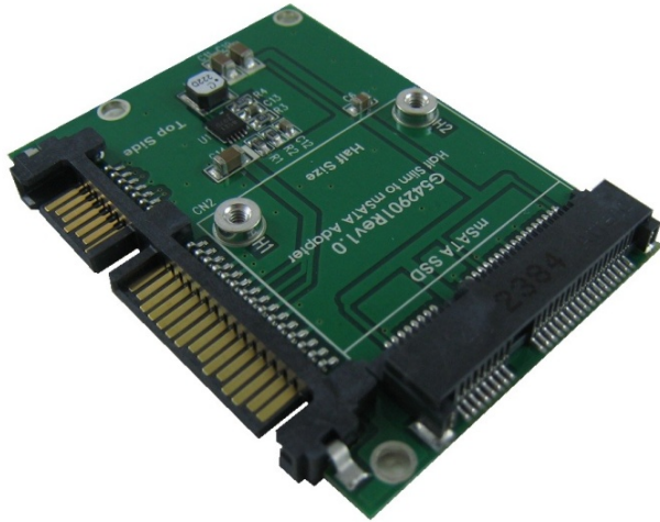
AD563FA9 Adapter top side