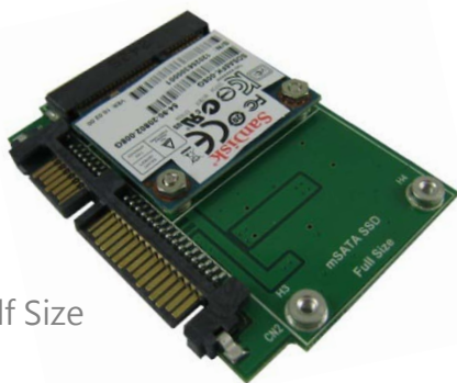
AD563FA5+Half Size mSATA SSD

AD563FA5 is SATA to mSATA adapter, providing one 7+15pin SATA connector on the host connection and one Mini PCI-e 52-pin connector on the SSD storage devices connections. When assembled, it can operate in a variety of operating systems. Such as DOS, Windows 95, 98, XP, 2000, Vista, Win 7, Linux, Unix, and so on. AD563FA5 adapter allows the installation of mSATA SSD as system disk, boot the operating system directly, without having to install any drivers, but does not affect the execution speed of the mSATA SSD.