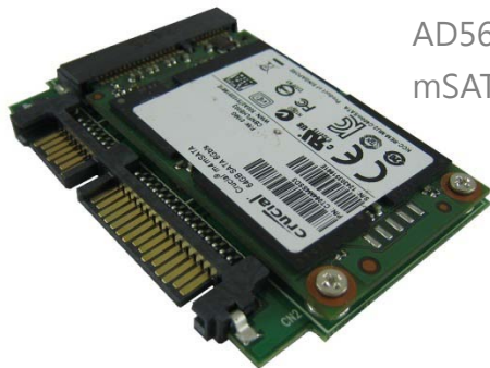
AD563FA5+Full Size mSATA SSD