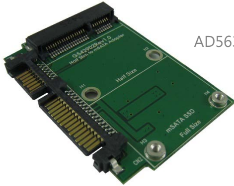
AD563FA5 Top Side