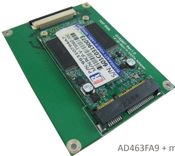
AD463FA9 + mSATA