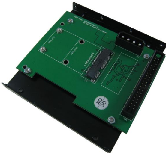
AD263FE9 Adapter with 3.5" Bracket