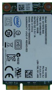
Intel mSATA SSD

AD263FB9/E9 is a 3.5" IDE SSD. It uses a 3.5" Frame Bracket, coupled with the mSATA SSD combination to IDE adapter. When assembled, it can operate in a variety of operating systems. Such as DOS, Windows 95, 98, XP, 2000, Vista, Win 7, Linux, Unix, and so on. AD263FB9/E9 adapter allows the installation of mSATA SSD as system disk, boot the operating system directly, without having to install any drivers, but does not affect the execution speed of the SSD storage devices.