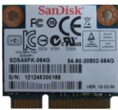
Sandisk mSATA SSD